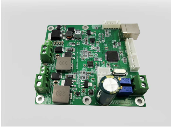
OEHTC-200 Heater Temperature Controller (OEM)