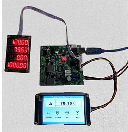
OETTC-200 Heater Temperature Controller (OEM)

The OEM version of the controller (OEHTC-200) comes as a PCB, which can be either connected to a computer, using the USB port, or it can be operated in stand-alone mode. Two potentiometers on the board are available for setting up the temperatures of each cannel. Once all the parameters are set, the stand-alone operation of the controller can be easily enabled, using the integrated DIP-switch.