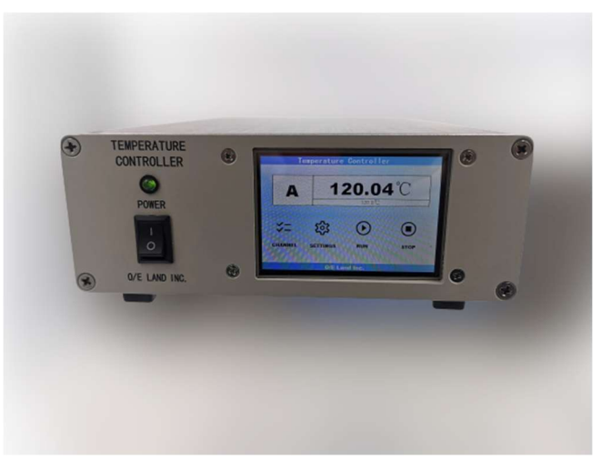
OEHTC-100 Heater Temperature Controller (Bench-top)